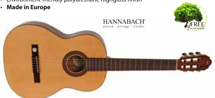
500.118 4/4 size