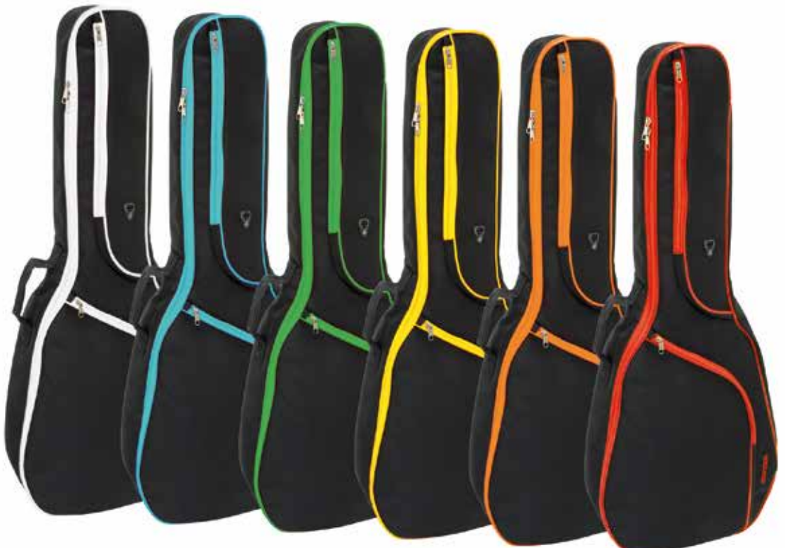
212.610* Concert 3/4 size 6 pcs assorted