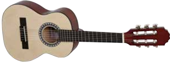
PS510.310* 1/4 natural