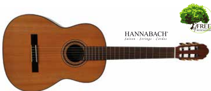
500.420 Natural Gloss