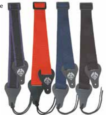
531.010 10 pieces assorted