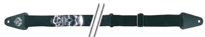
531.015 Black/White Skull