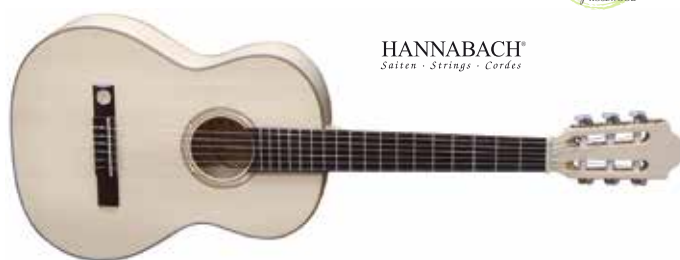
500.210 3/4 Size