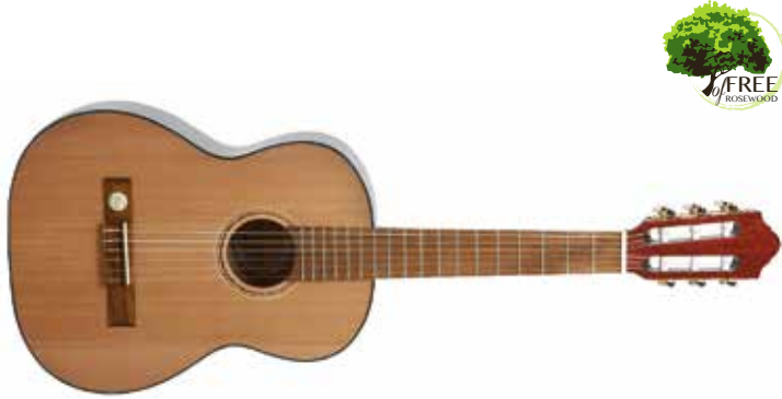
500.180 1/2 Size