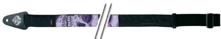
531.016 Purple Skull