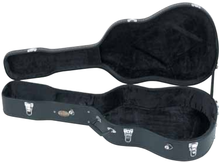
523.271 Acoustic Guitar 523.272 Western Guitar 12-string