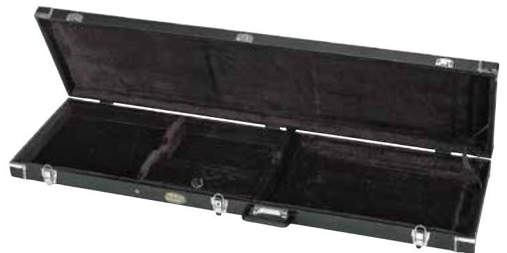
523.130 E-Guitar Universal