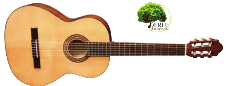
PS500.171 4/4 Size