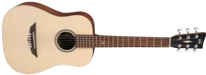
VG500.291 Natural Satin Open Pore