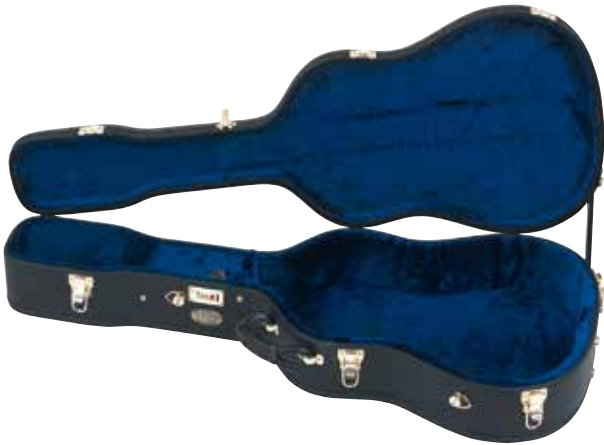
523.532 Western Guitar 6-string