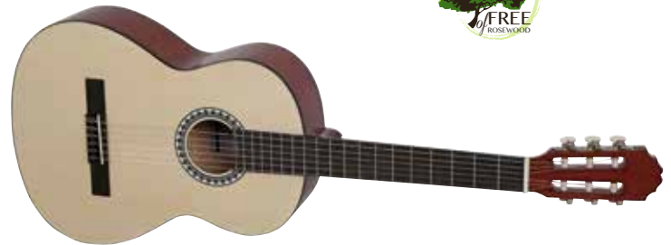
PS510.350* 4/4 natural PS510.356* 4/4 black