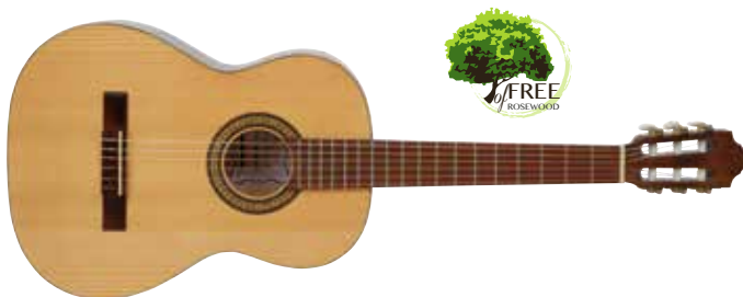
PS500.159 7/8 size