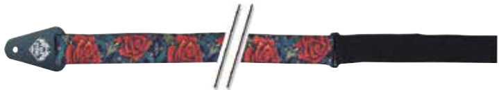
531.014 Red Roses