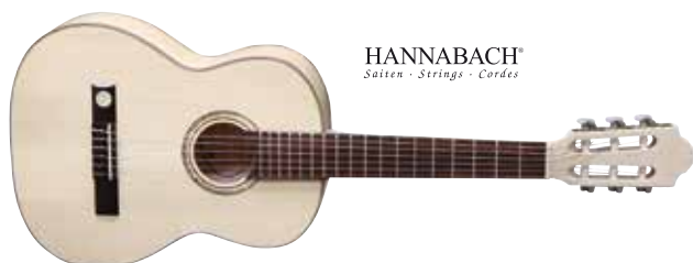
500.200 1/2 Size