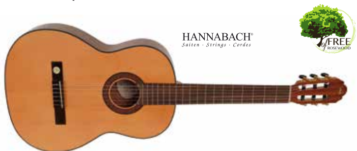
500.130 4/4 size