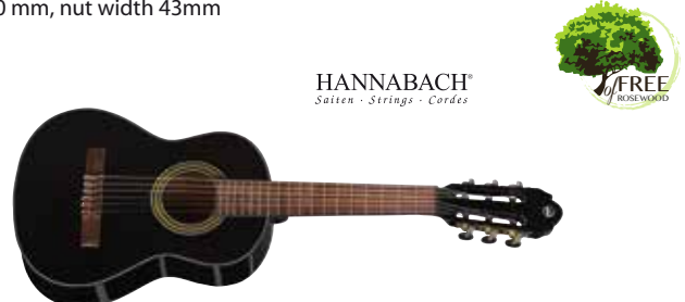
VG500.102* 1/4 size black