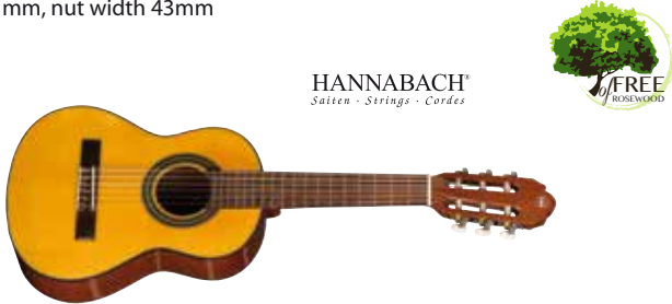
VG500.100* 1/4 size nature