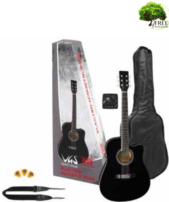
PS502.236 Guitar black