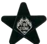
523.899 Star-shaped pick, black