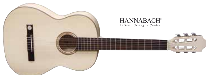
500.220 7/8 Size