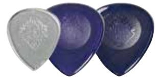
523.891 1,00 mm, clear