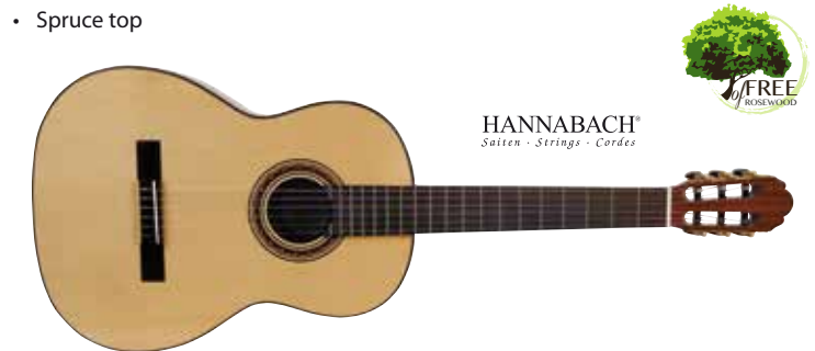
500.422 Natural Gloss