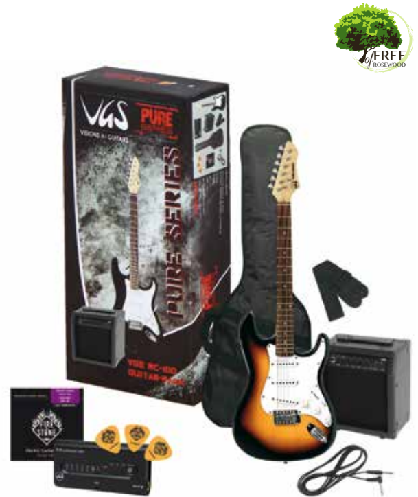
PS502.543 3-Tone Sunburst