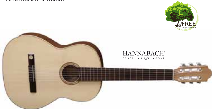
500.234 4/4 Size