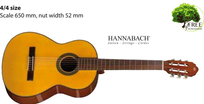
VG500.140* 4/4 size nature