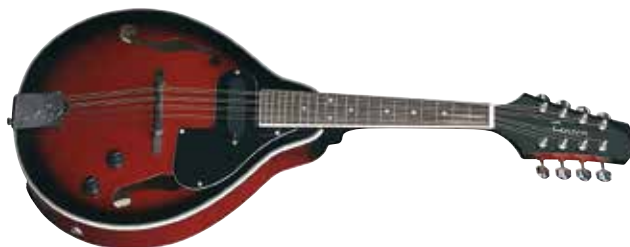
F505.410 Black Cherry