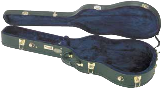
523.531 Classic guitars