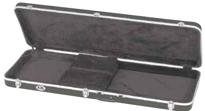
F560.380 E-Guitar Universal F560.390 E-Bass Universal