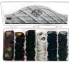
523.860 Assortment box 600 pieces