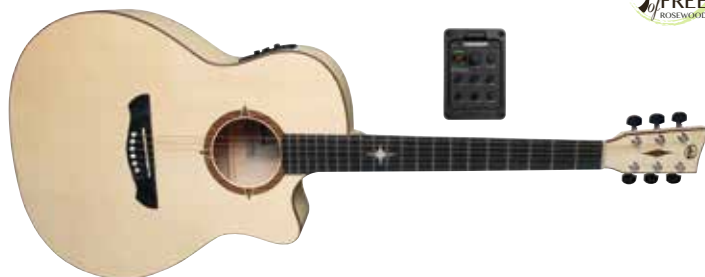
VG500.920 Natural Satin Open Pore