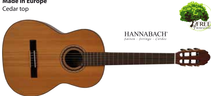
500.410 Natural Satin Open Pore