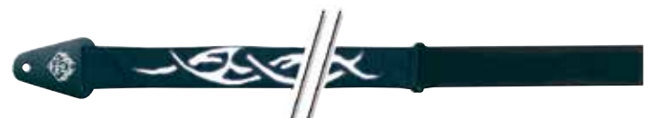
531.018 White Tribal