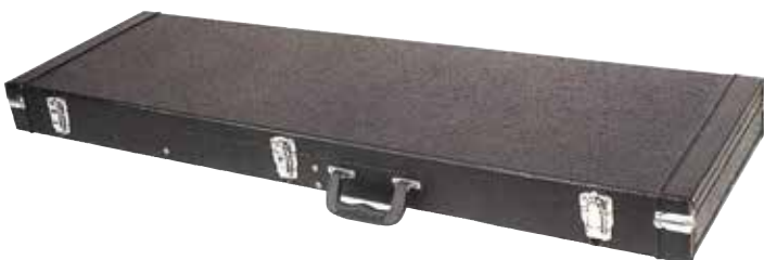
F560.180 E-Guitar Universal F560.190 E-Bass Universal