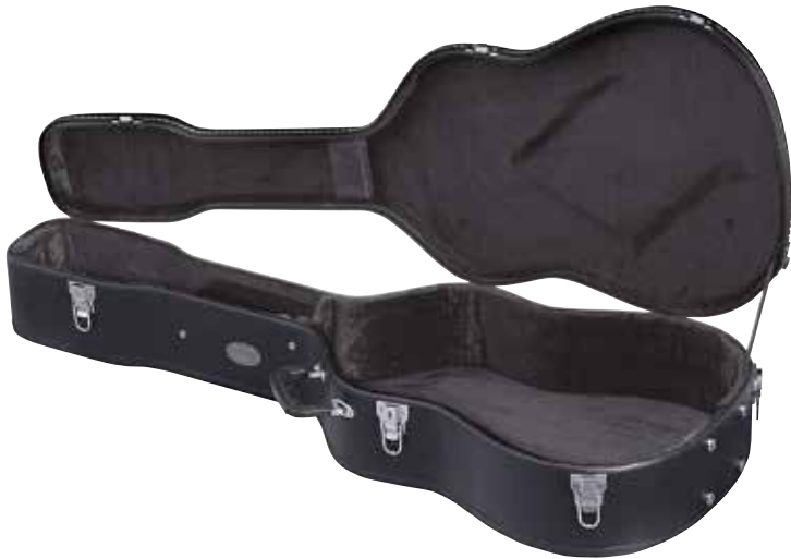
523.110 Western Guitar 6-string