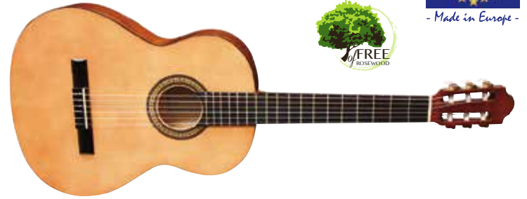
PS500.161 4/4 Size