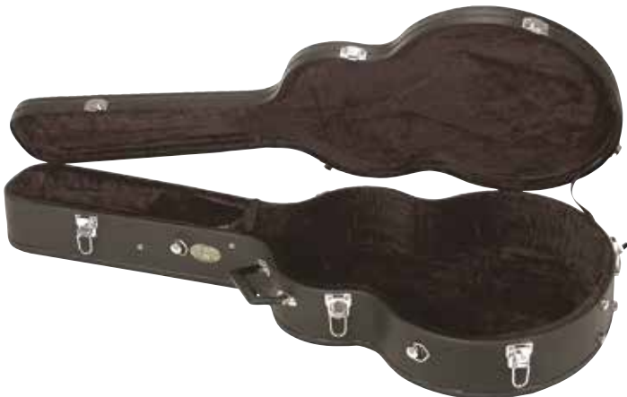
523.278 Jumbo/Jazz Guitar 523.280 ES-335 semi-acoustic