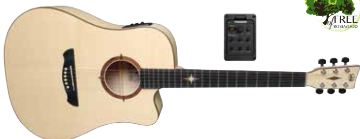
VG500.910 Natural Satin Open Pore