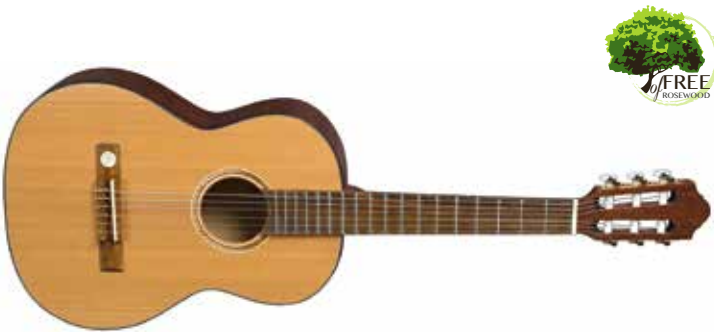
500.184 3/4 Size