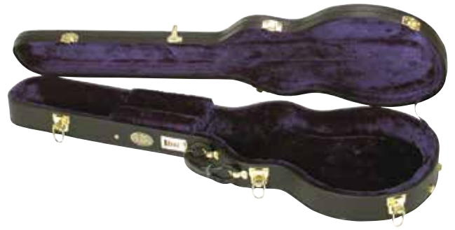
523.544 Les Paul Model