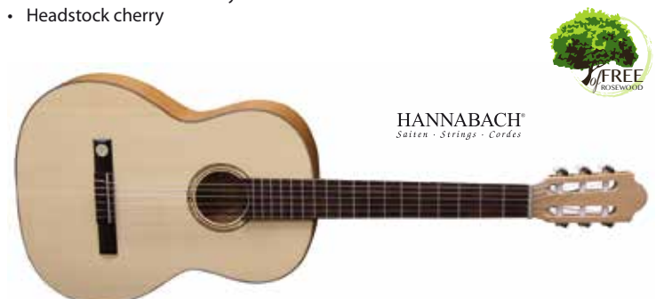
500.260 4/4, all solid