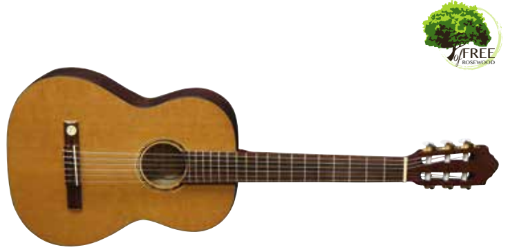
500.186 7/8 Size