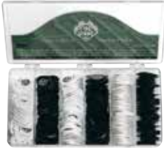
523.850 Assortment box 600 pieces