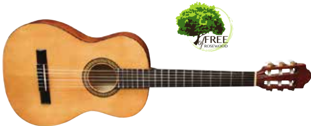
PS500.156 3/4 Size