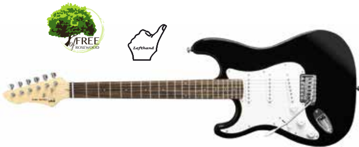
PS503.101 Lefthand, Black