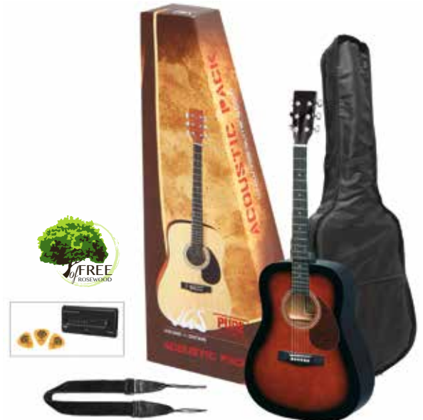
PS502.212 Guitar violinburst