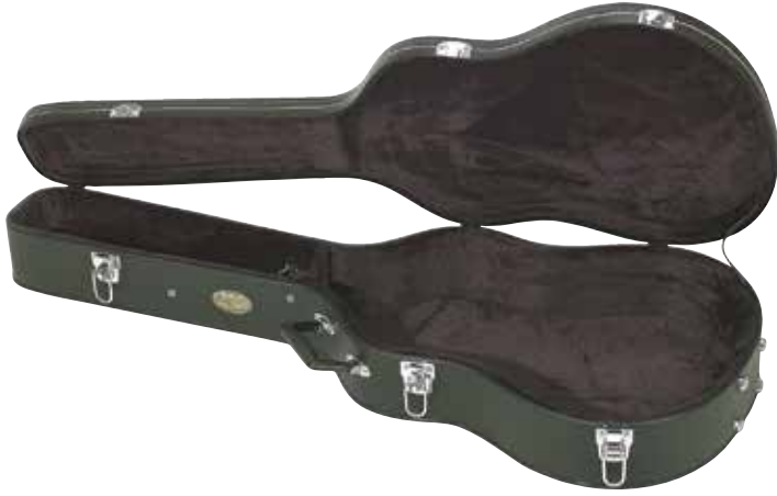
523.100 Classic guitars