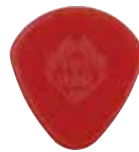
523.887 semicircular, red