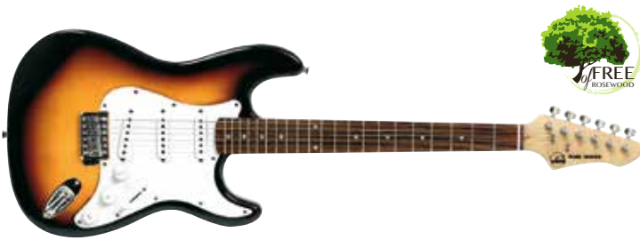
PS503.103 3-Tone Sunburst