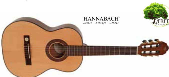
500.107 3/4 Size