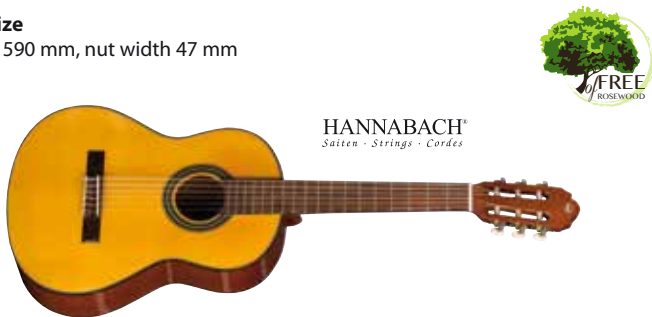
VG500.120* 3/4 size nature