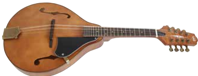
505.448 Open Pore Vintage