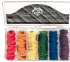
523.870 Assortment box 600 pieces