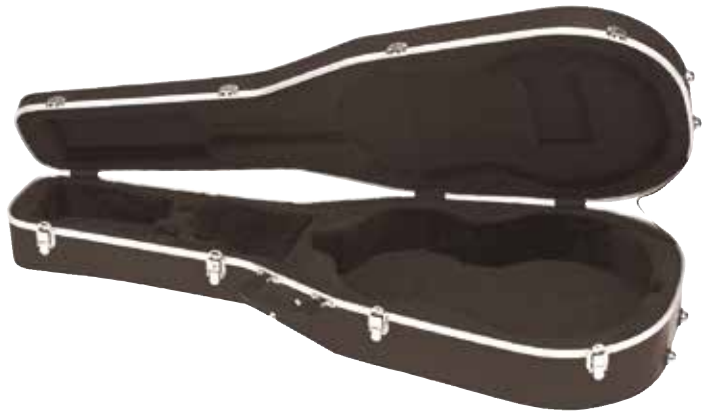
523.321 Classic guitars 523.322 Acoustic Guitars