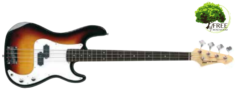
PS504.103 3-Tone Sunburst