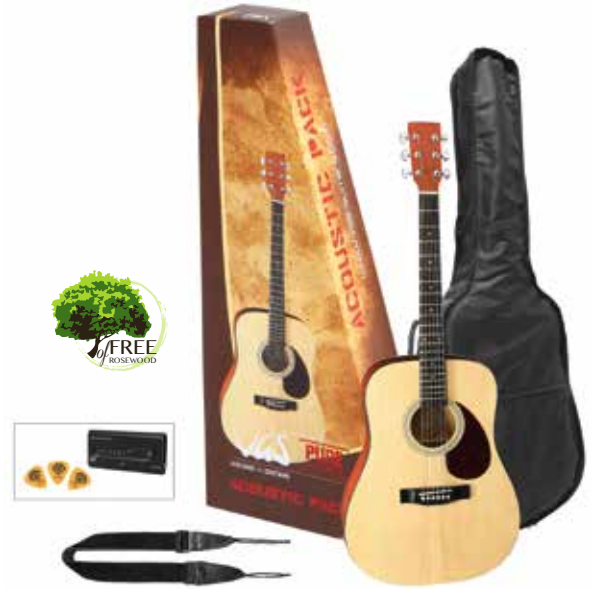
PS502.210 Guitar natural