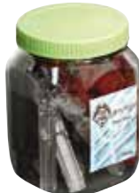
570.444 Tin with 24 Pcs