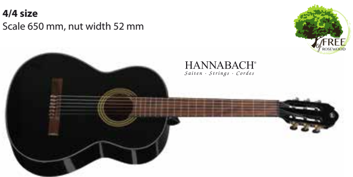
VG500.142* 4/4 size black