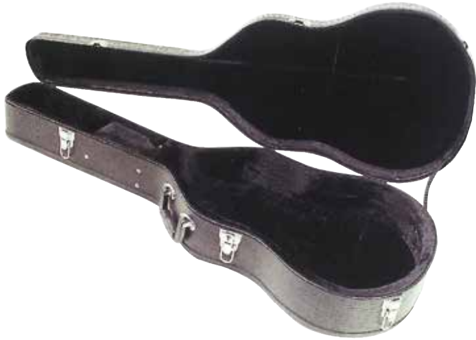
F560.110 Classic guitars F560.120 Western 6-string F560.130 Jumbo/Jazz 6-string