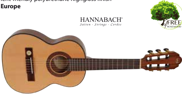
500.100 1/4 size