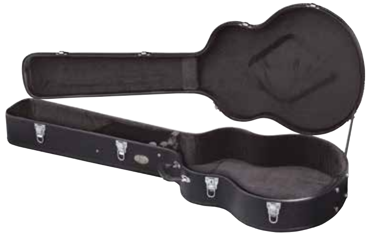
523.114 Jumbo/Jazz Guitar