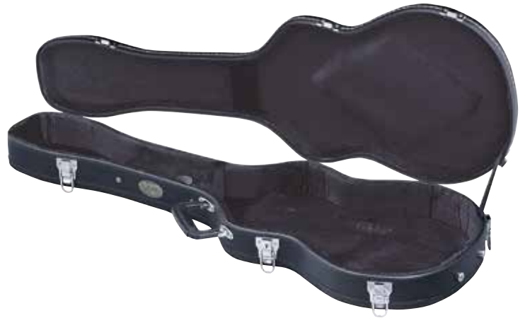
523.120 Les Paul Model