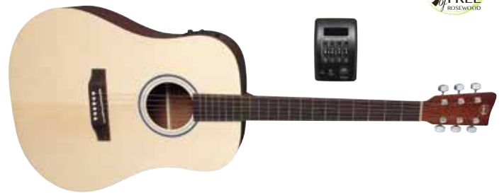
VG500.298 Natural Satin Open Pore