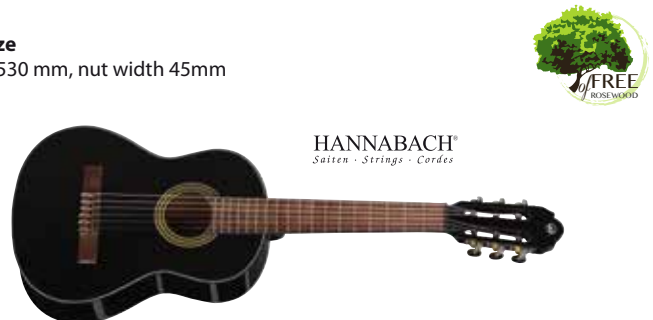
VG500.112* 1/2 size black