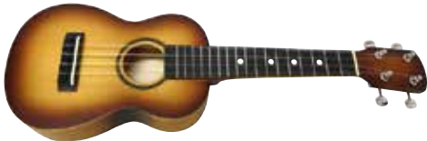
512.835 Brown Sunburst