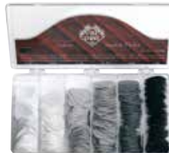
523.880 Assortment box 600 pieces