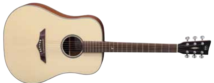
VG500.301 Natural Satin