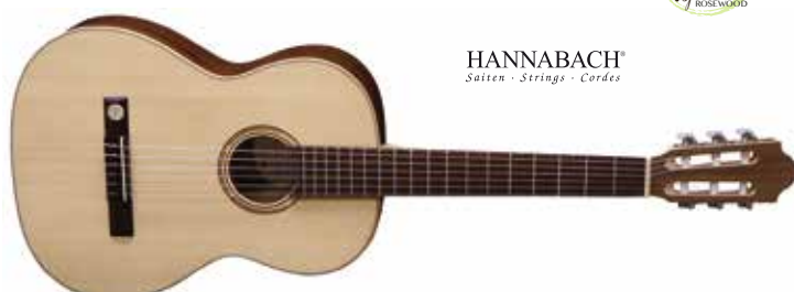
500.224 7/8 Size