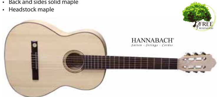
500.250 4/4, all solid