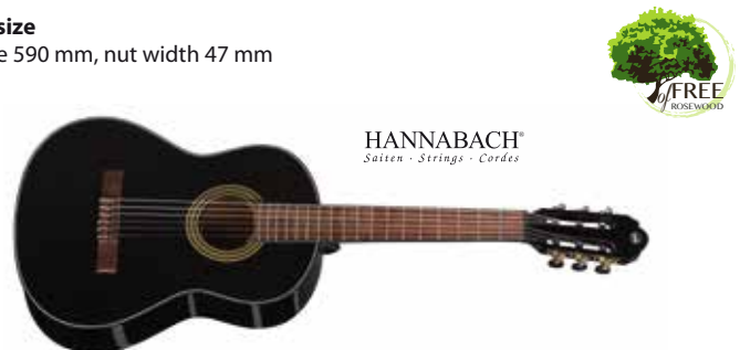
VG500.122* 3/4 size black