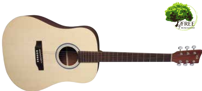
VG500.294 Natural Satin Open Pore