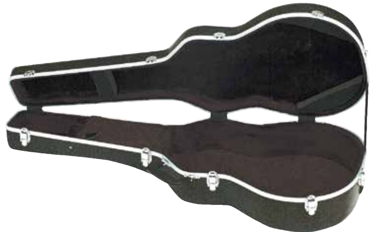
F560.310 Classic guitars F560.320 Acoustic 6-string