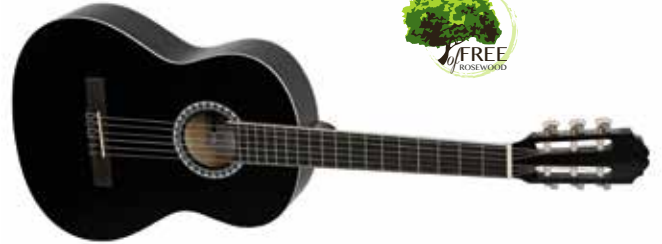
PS510.340* 3/4 natural PS510.346* 3/4 black