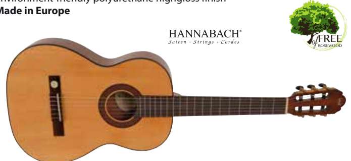
500.110 7/8 size