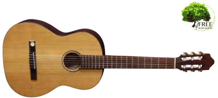
500.188 4/4 Size