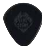
523.888 semicircular, black