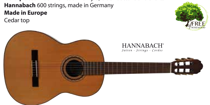
500.430 Natural Gloss