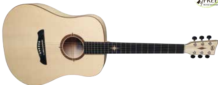
VG500.900 Natural Satin Open Pore