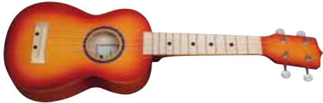
512.830 Yellow-red Sunburst