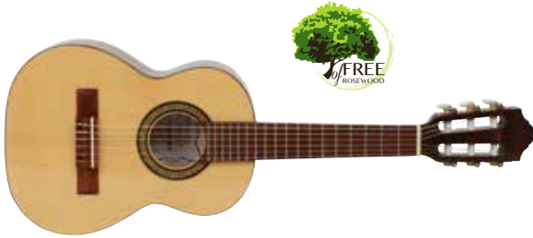
PS500.146 1/4 size