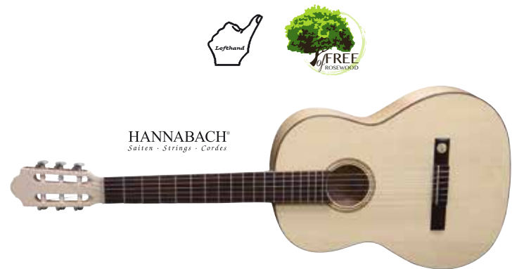
500.231 4/4 size