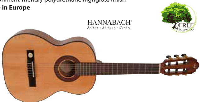
500.103 1/2 size