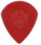
523.889 pointed, red