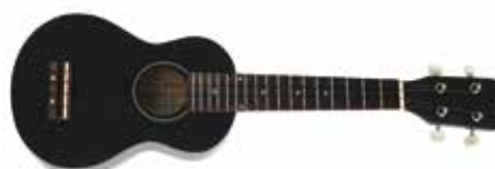
PS512.822 Matt black