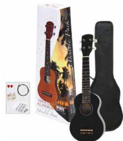
PS502.822 Ukulele matt black