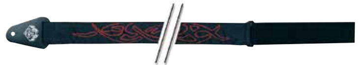
531.019 Red Tribal