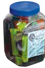
570.469 Tin with 25 Pcs