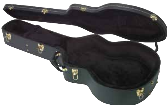
523.535 Jumbo/Jazz Guitar