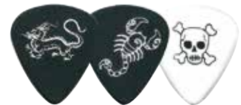
523.896 Dragon 351 shape, black