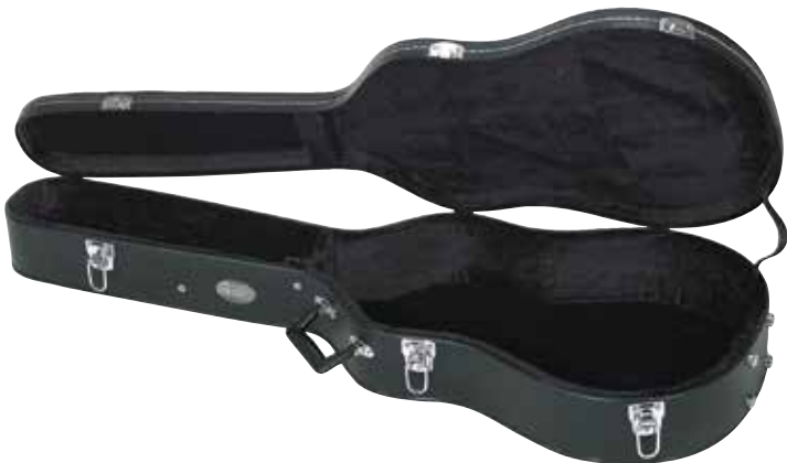
523.112 Yamaha APX