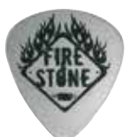
523.900 Stainless steel medium