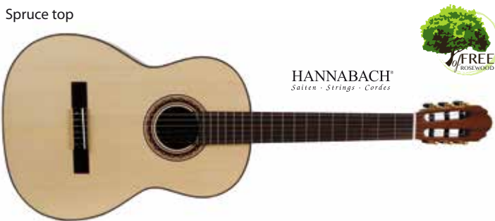
500.412 Natural Satin Open Pore