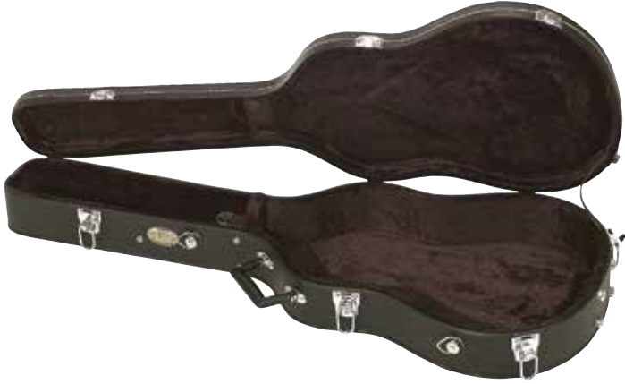
523.270 Classic guitars