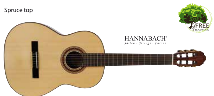
500.432 Natural Gloss