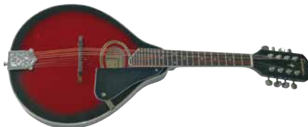
F505.400 Black Cherry