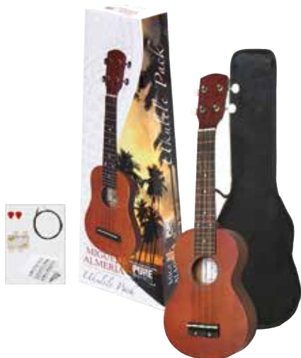
PS502.820 Ukulele red brown