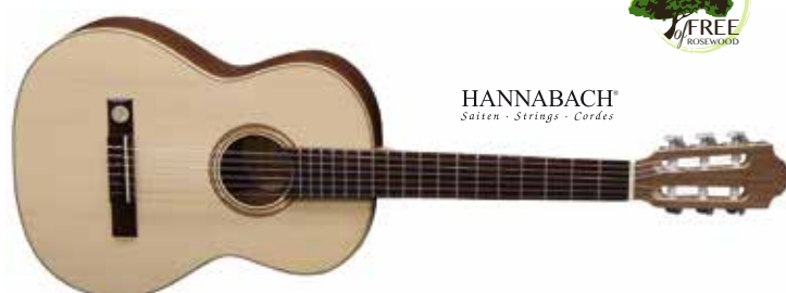
500.214 3/4 Size