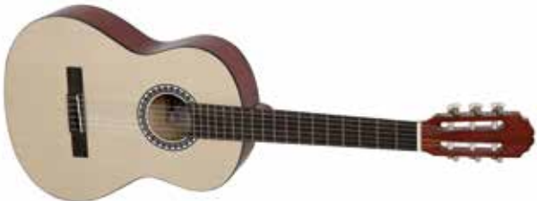
PS510.320* 1/2 natural