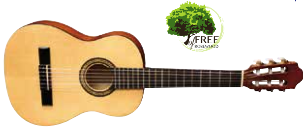
PS500.151 1/2 Size