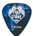
523.866 0,81 mm, perloid-blue