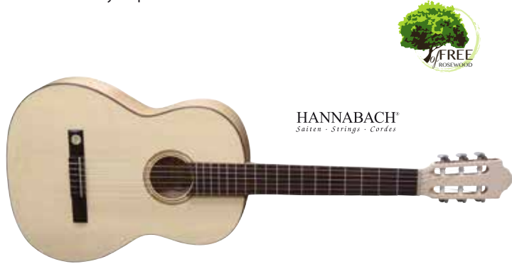
500.230 4/4 Size