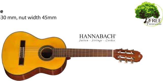
VG500.110* 1/2 size nature